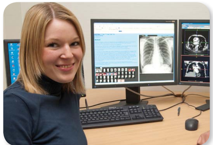
Medical students at the university working on a radiology teaching case accessed through the online e-learning platform