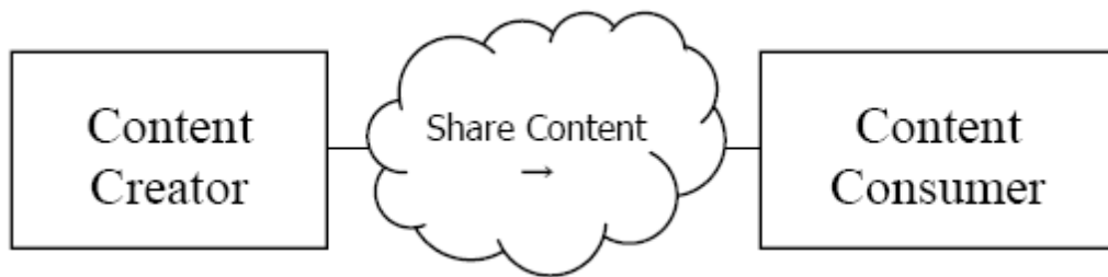
Figure X.3-1: Actor Diagram

There are two actors in this profile, the Content Creator and the Content Consumer. Content is created by a Content Creator and is to be consumed by a Content Consumer. The sharing or transmission of content from one actor to the other is addressed by the appropriate use of IHE profiles described below, and is out of scope of this profile. A Document Source or a Portable Media Creator may embody the Content Creator. A Document Consumer, a Document Recipient or a Portable Media Importer may embody the Content Consumer. The sharing or transmission of content or updates from one actor to the other is addressed by the use of appropriate IHE profiles described in the section on Content Bindings with XDS, XDM and XDR in PCC TF-2:4.1.